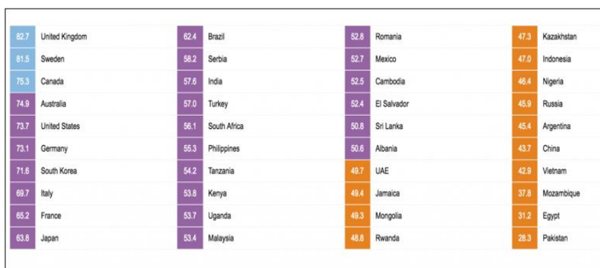
Figure 3. Out of Shadows Report

UNICEF Child Protection collaborated with partners from 153 countries to sustain success in the last year of its Strategic Plan, 2018-2021. UNICEF changed programs to address vulnerable and disadvantaged children worldwide, reaching more children than ever in several areas of UNICEF's child protection work.