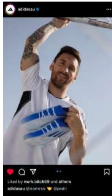
Figure. adidas AU Footwear on World Cup.