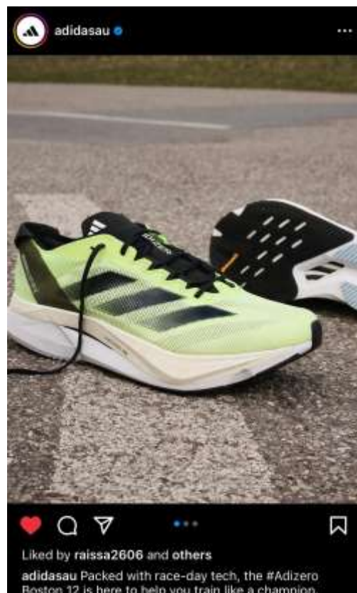
Figure . adidas AU shared media.