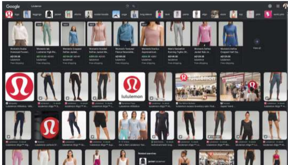
Figure. lululemon Google search image.

positioning as outlined in client briefs (Stauffer, n.d.); a cursory Google image search corroborates this (Figure 6). The objective of Lululemon AU's footwear category is to gain traction among male consumers (Stauffer, n.d.). Currently, however, the communication impact it generates is largely oriented towards women (Keller, 2016), potentially affecting how the intended audience perceives it. once the footwear launches, which is unisex, not only women (Stauffer, n.d.).