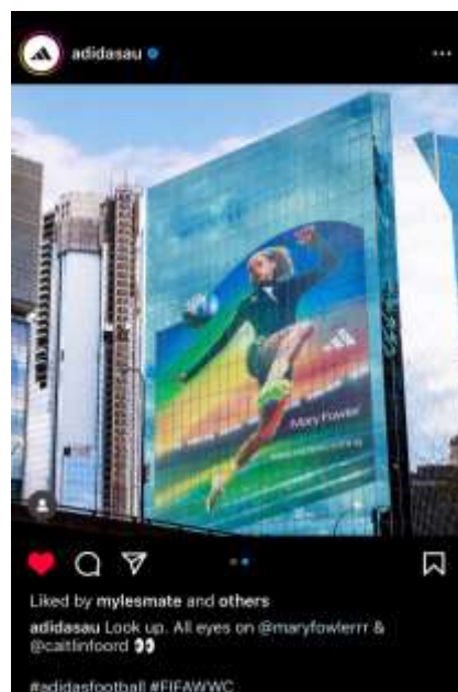
Figure. adidas AU Footwear on Fifa Women's World Cup.

Adidas AU footwear stands out for its effective branding as a unisex product line, avoiding favoritism towards any specific gender. This is evident in their support for sports events of both genders, such as the Fifa Women's World Cup (Figure 11). If Adidas AU were involved in a male-dominated event like the World Cup (Figure 12), they would similarly promote equality. This balanced exposure strategy, as noted by Keller (2016), contributes significantly to their strong brand positioning (Kosteljik & Alsem, 2020) as an athletic brand that caters to both genders, akin to the goals of Lululemon AU.