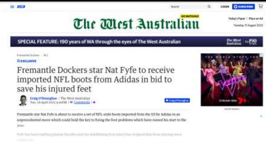
Figure. adidas AU Footwear earned media.